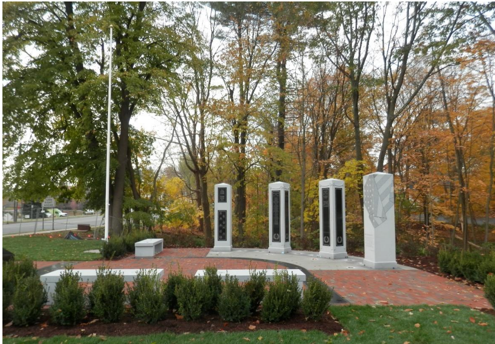
SIMSBURY VETERANS MEMORIAL COMPLETED